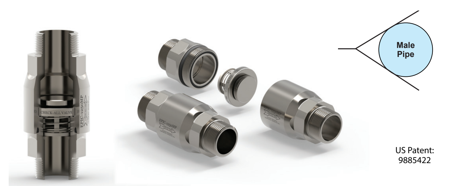
The EPIC ° Male Pipe valve is a poppet style check valve with male NPT threaded connections machined from 300 series stainless steel bar stock with Aflas° seat/seals and a 1/2-PSI stainless steel spring setting (cracking pressure) that can be installed in any flow orientation. This check valve achieves a high flow capacity and reduced pressure loss compared to other poppet style check valves of similar sized connections. Additionally, the EPIC series incorporates a drop-in replaceable check mechanism (Replaceable Insert Kit sold separately) that is easily installed into the existing body without requiring additional assembly of checking components.

Due to the materials of construction, high flow capacity, field repairability and the quality customers have come to expect from Check-All, the EPIC check valves are uniquely suited for a very wide range of applications in liquids, gases and steam.